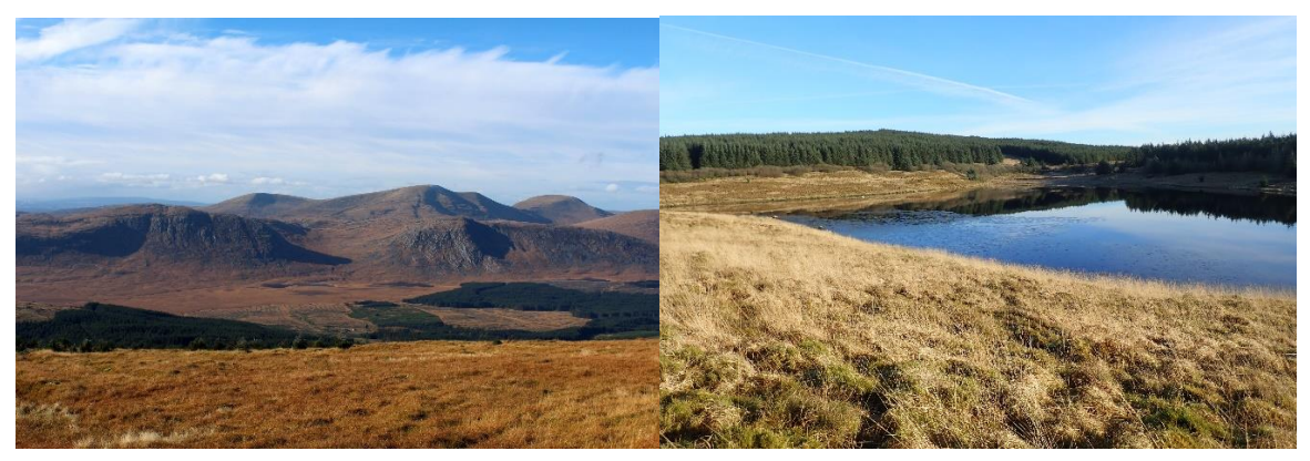
The beautiful countryside of South West Scotland

Increasingly, Scotland is being transformed into an industrial wasteland by ill-considered and thoughtless wind farm developments which provide little benefit to local residents