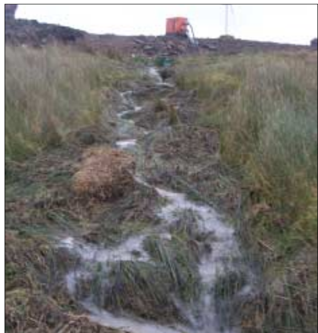
A spot near the northerly quarry. Note the abandoned straw bale (see also pps 3 & 5). 2 December 2006