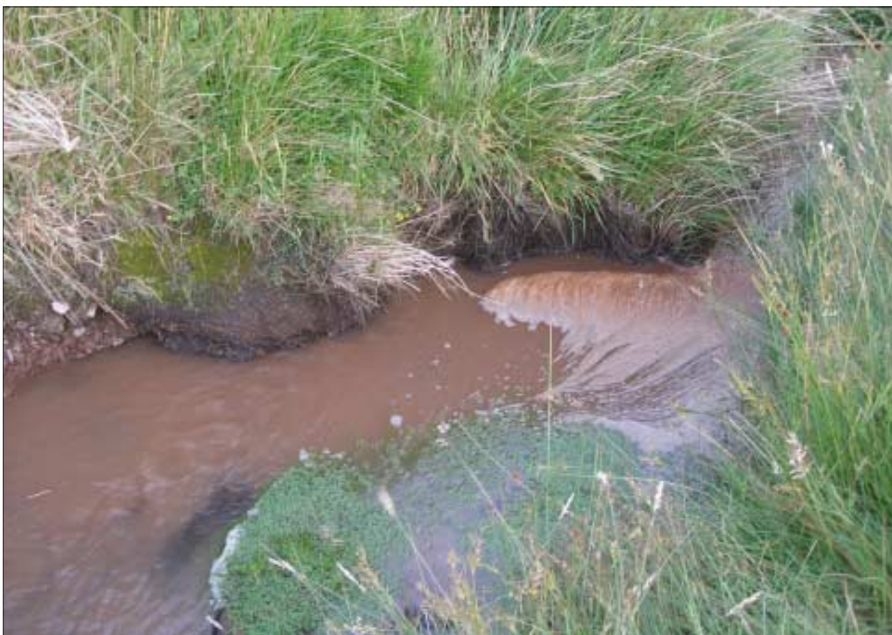
The Garvald Burn just south of the spot on pps 5 and 18 but two months earlier (1 October 2006). Although SEPA told MSP Murdo Fraser that 'River samples taken . . . when the stream has been highly coloured indicate that the suspended solids concentration is surprisingly low', an independent study suggested they were ten times control levels after heavy rain.

It is apparent that the wind farm construction and the after effects of same are going to seriously affect the conservation aims of the Teith/Ardoch Burn SAC which are to protect the salmon and three species of lamprey. As the main effect is that of silting, it is going directly against the purpose of the SAC. This is because the life cycles of the four fish species to be protected depend on silt-free spawning gravel and well-oxygenated water with an abundant food supply and, in the case of the lampreys, fine organic mud in the quieter areas of the river or stream.