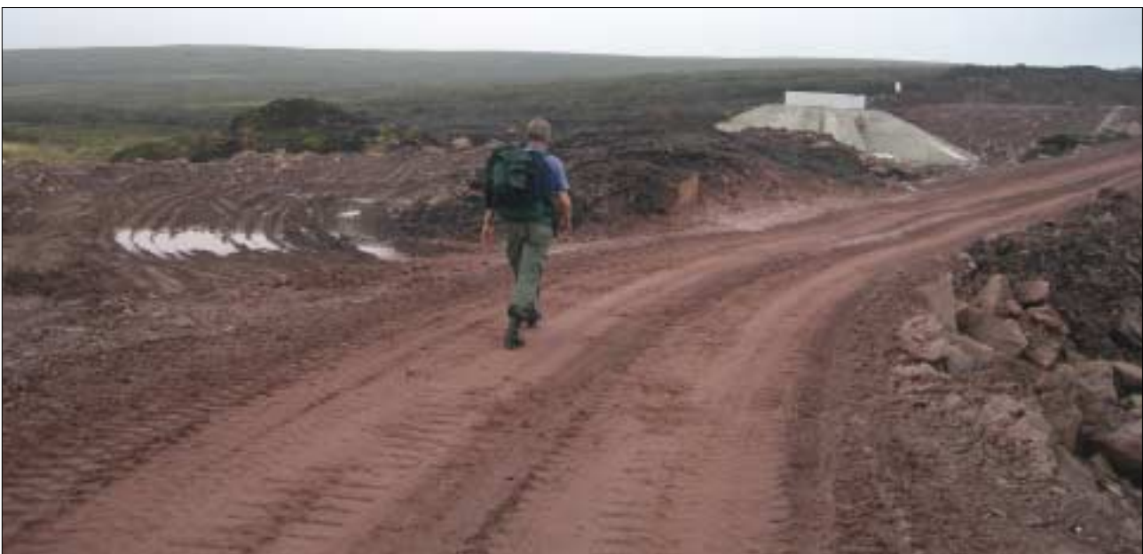
An access track on the north-eastern periphery of the site, October 2006. This area drains to the north, not the SAC, but the picture illustrates the friable or 'less than competent' nature of the sandstone used for access tracks.

control stream during high-flow events coupled with less frequent sampling of a larger number of streams. The effort should also be more intensive over the first three to five years, when impacts are likely to be greatest, and reduced later when impacts are less. Nevertheless, given the natural fluctuations in climate and the occurrence of storm events, any long-term trends and recovery from any impact back towards the natural state will only be clearly seen over an eight- to ten-year period.