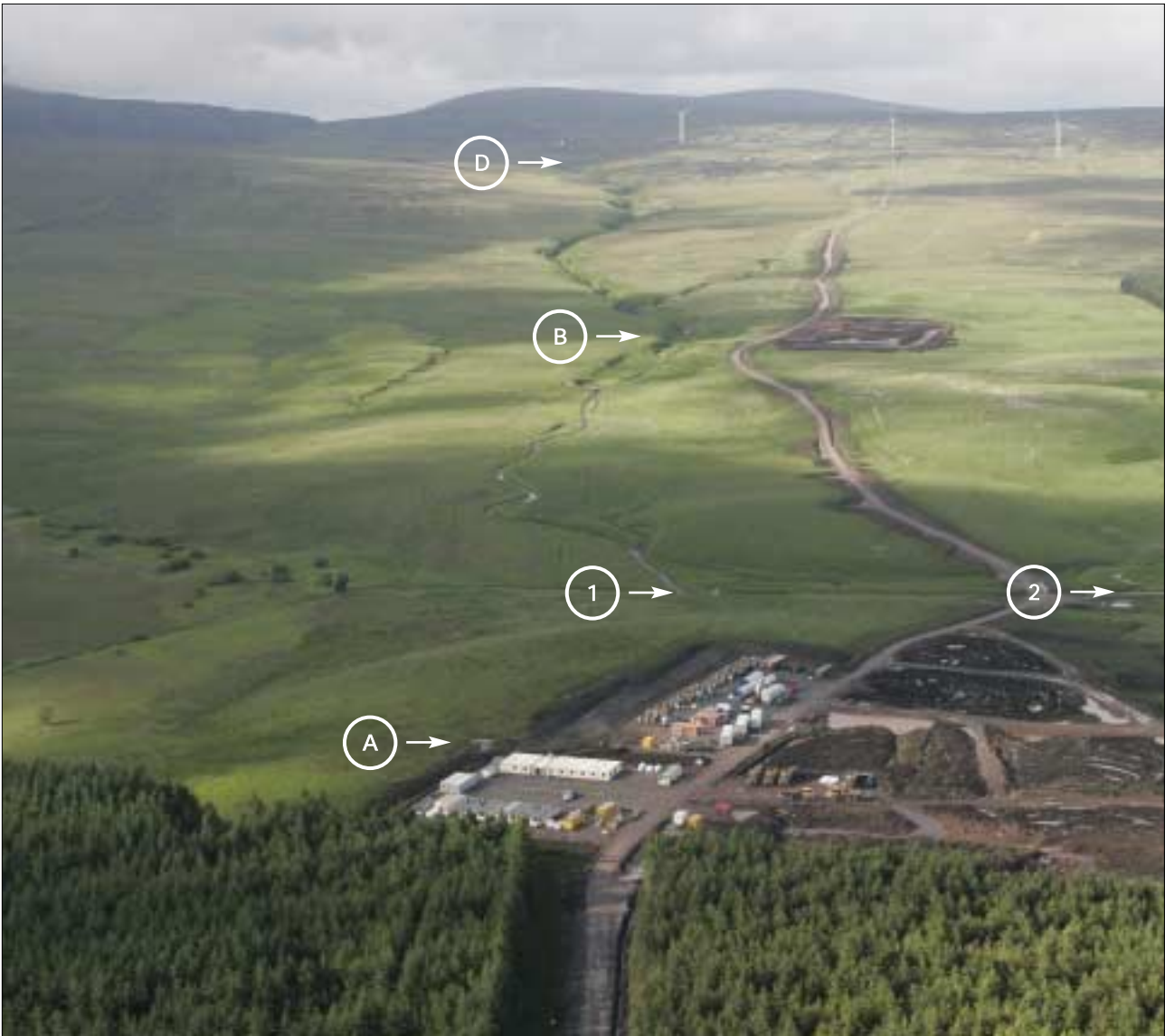
The southern end of the site, looking north. The compound and peat dump in the foreground is at point A on the map on p 6. Other features include: B, the southerly of the two quarries/peat dumps excavated adjacent to the Garvald Burn and D, the northerly quarry. Not marked on the map are: 1, the confluence of the Ardoch and Garvald Burns; and 2, the point at which samples were taken that purported to come from the Garvald Burn. Viewpoint approx NN 713 064, 9 July 2006.

Annexes and appendices to this report, including the full list of pollution incidents and the text of documents quoted in it, can be found on www.friendsofthebraes.org .