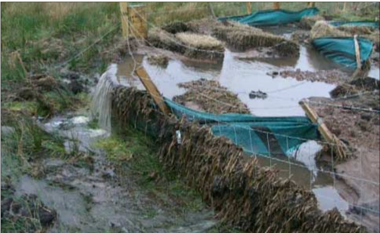
A 'silt fence' by the northerly quarry. 29 December 2006, NN 712 107 The filtration arrangement, despite official approval, is obviously ineffective and the straw bales are as much pollutant as mitigation. (SEPA was unable to confirm that exhausted bales are being removed from the site.) This water is flowing into the Garvald Burn, part of the River Teith SAC. Other pictures from the same spot dated 1 October and 2 December suggest the problem is chronic. (See pps 3, 10 & 18.)

A July 2005 report noted that 'The ECoW has discussed the need for an ongoing programme to maintain established silt control measures (i.e. clearing of silt build-up from drainage channels, regular replacement of silty straw bales) . . . ' (#14)