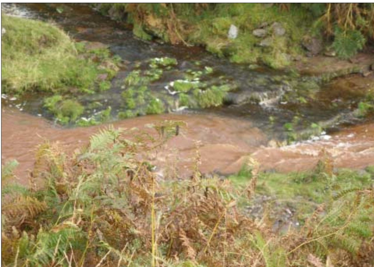
Also 1 October 2006, the Garvald Burn, still heavily polluted, about two kilometres to the south of the picture opposite. Barely outside the SAC's northern boundary, it is joined by an unpolluted tributary flowing off the wind farm site from the east. NN 715 092